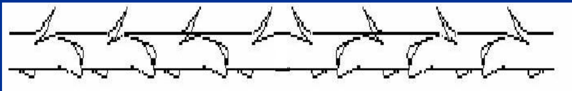
Barbed Bi-directional Surgical Suture

SITRA has designed and fabricated an equipment for the introduction of Bi – directional barbs into the sutures. Using PDS II (Polydioxanone) monofilament & Monocryl monofilament barbed sutures were produced by SITRA. Evaluation of the sutures for there bio-mechanical properties and wound closure efficiency are in progress.